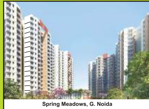
Spring Meadows, G. Noida