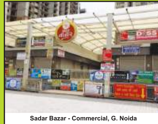
Sadar Bazar - Commercial, G. Noida